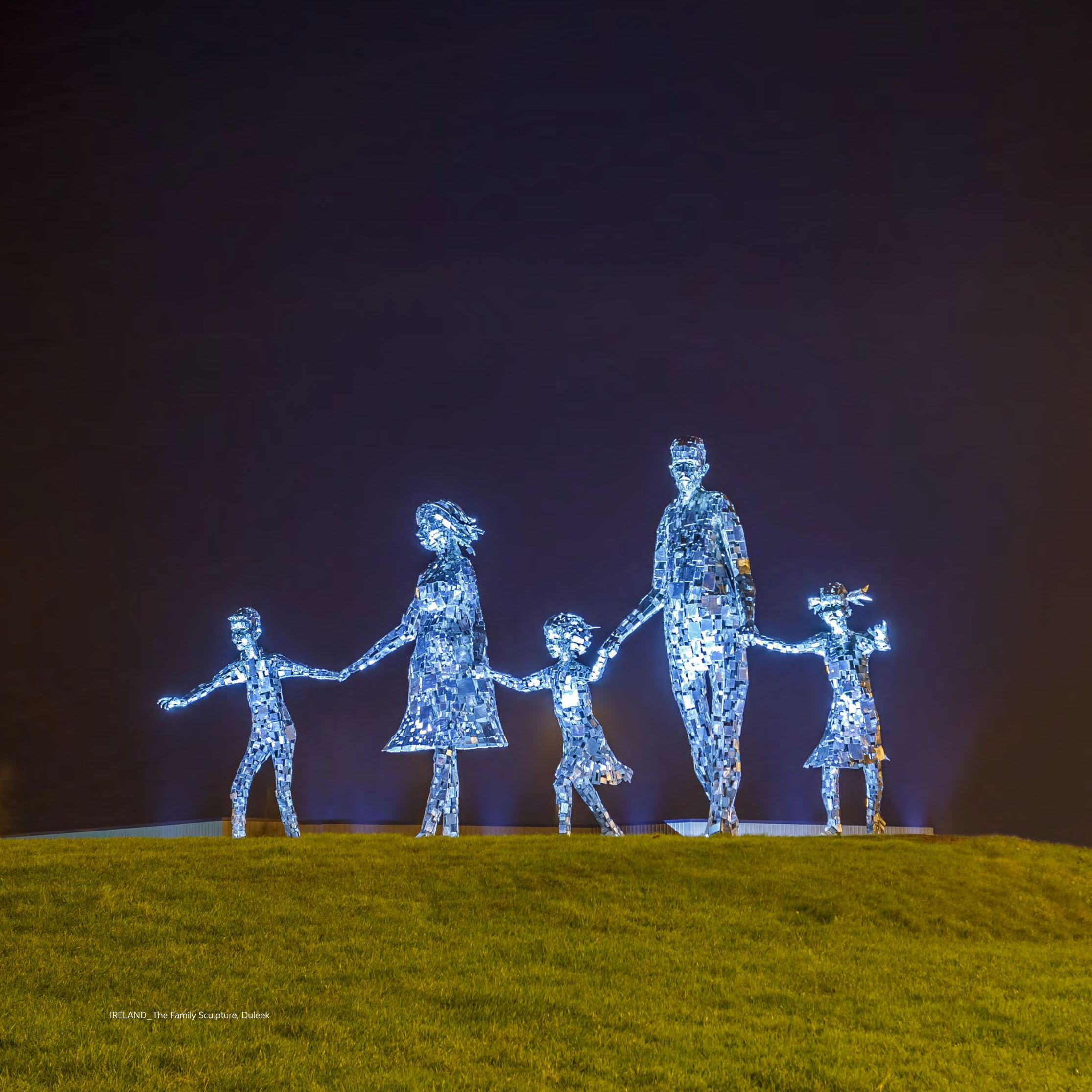
IRELAND_ The Family Sculpture, Duleek